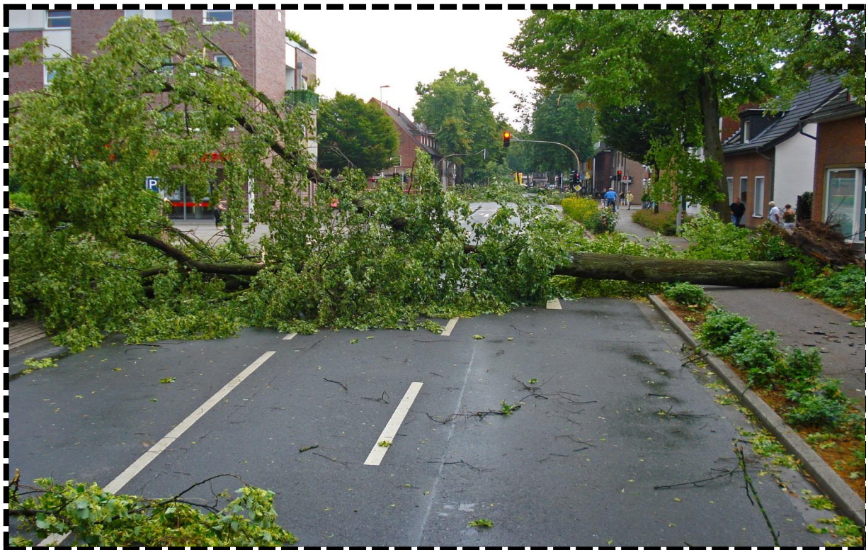
Orkan - Sturmschäden